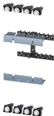
plug-in unit conversion kit for MCCB accessory for: circuit breaker, 4-pole 3VA1 250