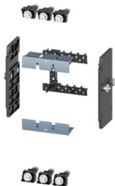
draw-out unit conversion kit for MCCB accessory for: circuit breaker 3-pole 3VA1 250