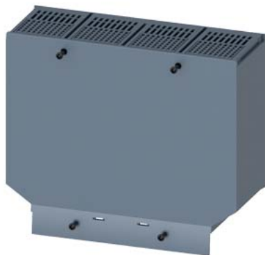
terminal cover offset 4-pole 1 unit accessory for: 3VA1 250