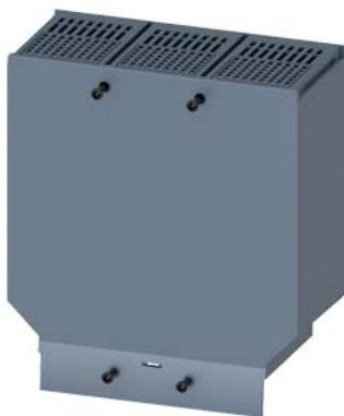
terminal cover offset 3-pole 1 unit accessory for: 3VA1 250