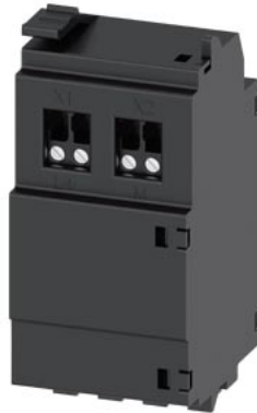
24 V module accessory for: 3VA2 100/160/250