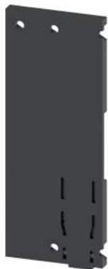
adapter for DIN rails accessory for: circuit breaker 3VA1 160, 2-pole