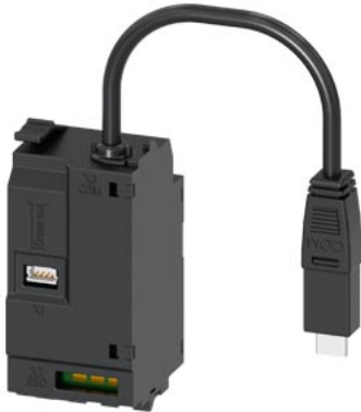
communication module COM060 accessory for: 3VA6 150/250