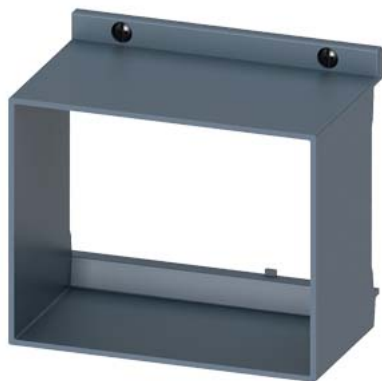
door feedthrough accessory for: circuit breaker, 3/4-pole 3VA2 100/160/250