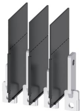
bus connector extended edgewise 4 units accessory for: 3VA1 100/160