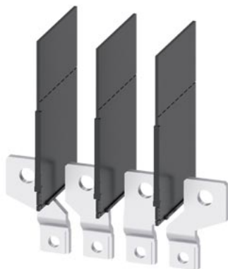
bus connector offset front 4 units accessory for: 3VA1 100/160