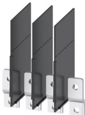
bus connector extended front 4 units accessory for: 3VA1 100/160