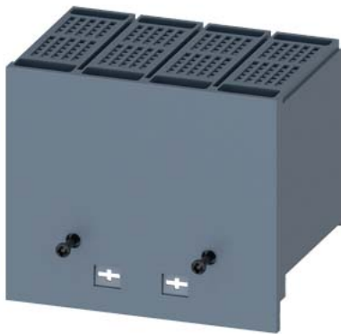
terminal cover long for plug-in and draw-out socket accessory for: circuit breaker, 4-pole 3VA1 100/160