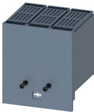
terminal cover long for plug-in and draw-out socket accessory for: circuit breaker, 3-pole 3VA1 100/160