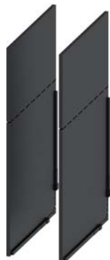
phase barriers 2 units accessory for: 3VA1 100/160