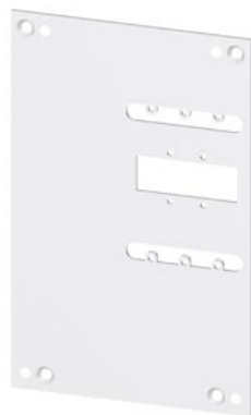
rear interlock mounting plate accessory for: 3VA5 125