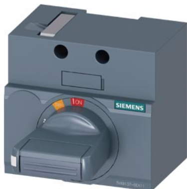
front mounted rotary operator standard IEC IP30/40 accessory for: 3VA5 125