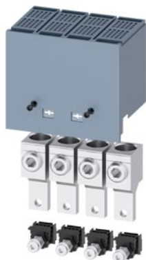
Wire connector TA2.1 4 AWG...300 kcmil large 4 units accessories for: 3VA5 125