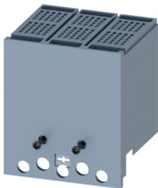
Terminal Cover Extended 3 pole; 1 pc. with probe holes for voltage testing accessory for: 3VA4/5 125 - -