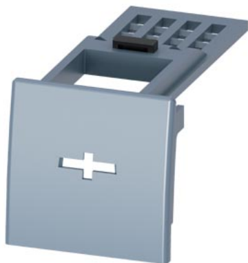
terminal cover 1-pole 1 unit accessory for: 3VA5 125