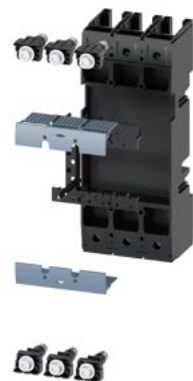
plug-in unit complete kit accessory for: circuit breaker, 3-pole 3VA2 100/160/250