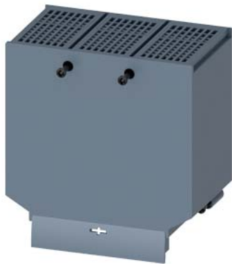
terminal cover offset 3-pole 1 unit accessory for: 3VA1 100/160