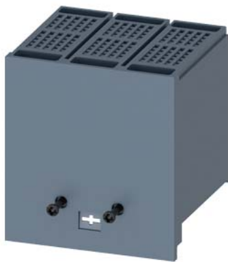
terminal cover extended 3-pole 1 unit accessory for: 3VA1 100/160