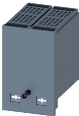
terminal cover extended 2-pole 1 unit accessory for: 3VA1 160