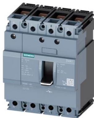
switch disconnecter 3VA1 IEC frame 160 4-pole SD100, In=160A without overload protection w/o short-circuit protection nut keeper kit