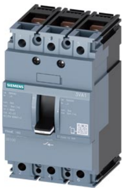
switch disconnecter 3VA1 IEC frame 160 3-pole SD100, In=160A without overload protection w/o short-circuit protection nut keeper kit