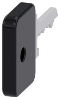
Key for key-operated switch O.M.R., lock number 73034, black