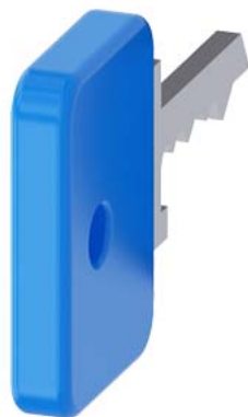
Key for key-operated switch O.M.R., lock number 73038, light blue