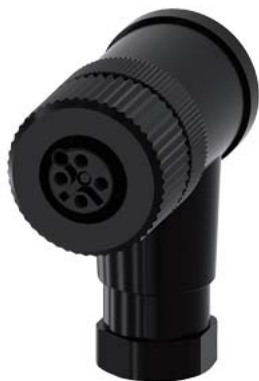
Connector for sensor switch, Angled socket with screw terminal connection