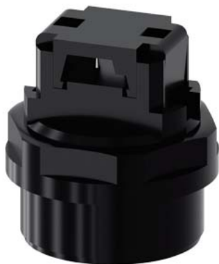
Adapter AS-i shaped cable (Insulation displacement system), M25 cable entry