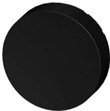
pushbutton, high, black, for pushbutton