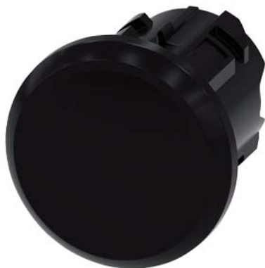
Sealing plug for unused round control points, 22 mm, plastic, black