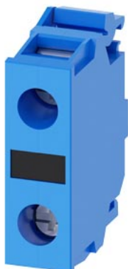
Support terminal, blue, screw terminal, for floor mounting