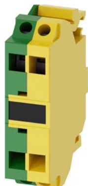
Support terminal, green/yellow, spring-type terminal, for floor mounting