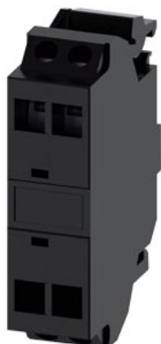
Support terminal, black, spring-type terminal, for floor mounting