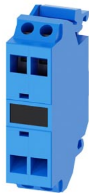
Support terminal, blue, spring-type terminal, for front plate mounting