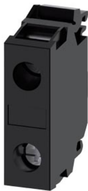
Support terminal, black, screw terminal, for front plate mounting