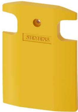
Cover yellow for position switch metal 3SE51, Enclosure 56 mm wide