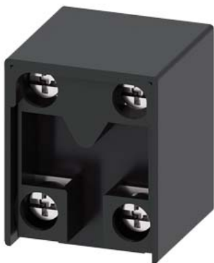
Contact block for position switch 3SE51/52 1 NO/1 NC quick action contact gold-plated contacts