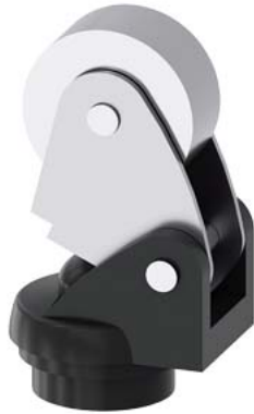
Actuator head for position switch 3SE51/52 Roller lever Metal lever and Stainless steel roller 22 mm