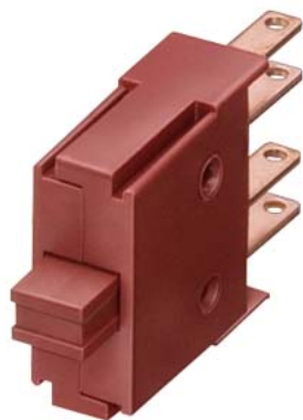
Contact block, 1 NO, with safety spring, flat connector terminal