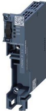
communication module Ethernet/IP