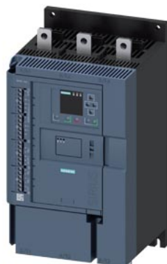
SIRIUS soft starter 200-690 V 210 A, 110-250 V AC Screw terminals