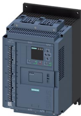
SIRIUS soft starter 200-480 V 63 A, 110-250 V AC Screw terminals