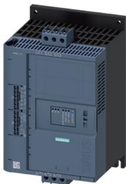
SIRIUS soft starter 200-600 V 13 A, 110-250 V AC spring-type terminals Thermistor input