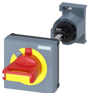
door-coupling rotary operating mechanism EMERGENCY OFF, size S00...S3 130 mm shaft