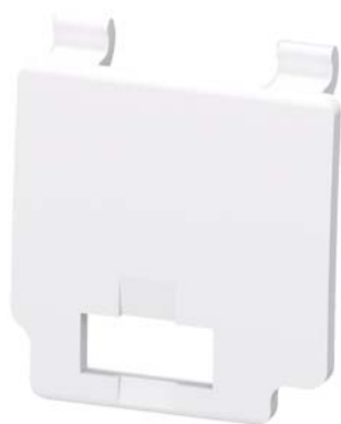
Scale cover, sealable for circuit breaker Size S00...S3