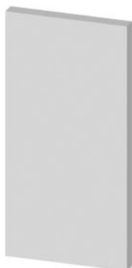
clip-on label 6 x 12 mm