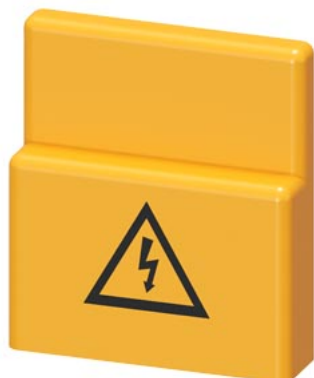
Accessory for SIRIUS 3RM1 Cover cap for busbars