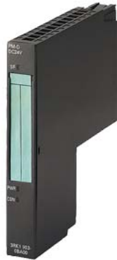
PM-D for ET 200S Power module for starter 24 V DC