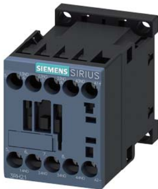
Contactor relay, 4 NO, 110 V DC, Size S00, screw terminal